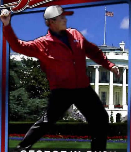
GEORGE W. BUSH